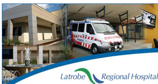
Latrobe Regional Hospital