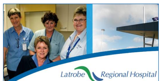
Latrobe Regional Hospital